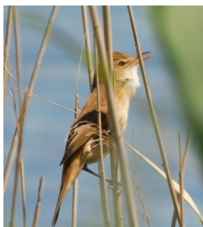
Australian Reed- Warbler