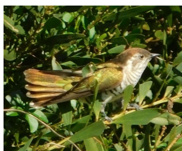
Little Bronze Cuckoo