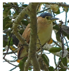
Nankeen Night-Heron (day-roosting)