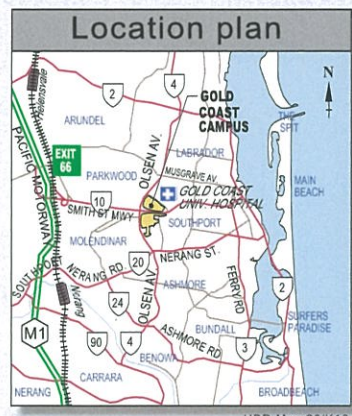
UBD Map 28/K10